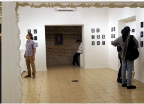
Photo exhibition in a gallery