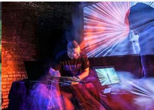
Electronic music performance