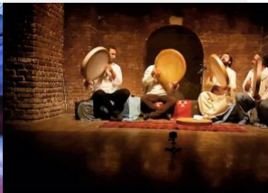
Four musicians performing on the Daf