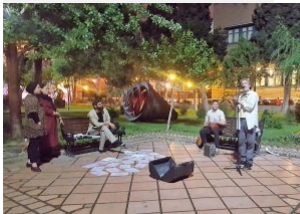
Tehran's Artists' Park offers cultural attractions both day and night