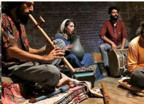
Experimental music performance