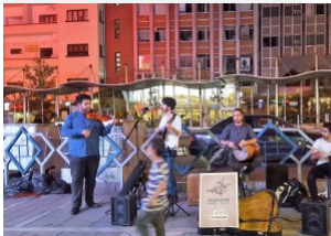
A band performing at a central crossroad in Tehran