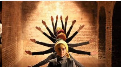
Modern Dance and Acting