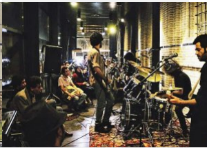
A band performing in one of Tehrans modern Cafés